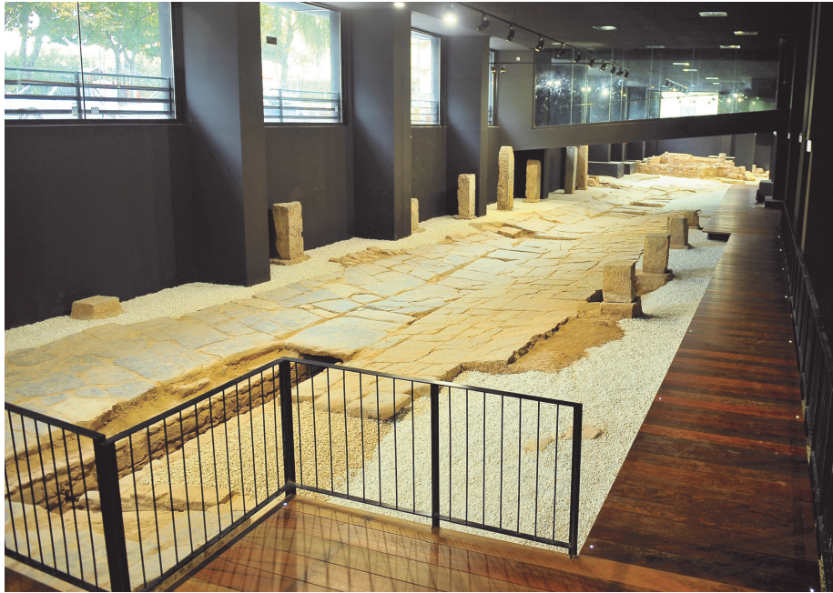
Figure 6: Image of the road inside the ‘Via del Pórtico’ Museum. Photograph: Higuera (courtesy of Sangunto City Hall, used with copyright-holder’s permission).

a military camp on Mount Curriechos. Its occupation period, around 25 B.C., coincides with the road construction process (Camino and Viniegra, 2010:376–377; González, 2011:180).