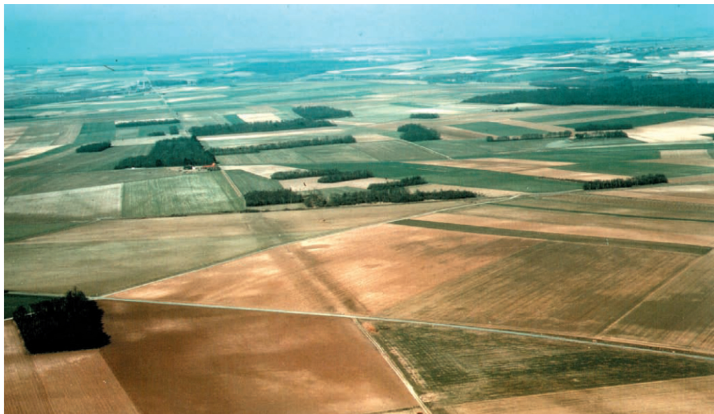
Figure 1: Aerial photography where evidence of a very long straight section of the Via from Amiens to Senlis, in Oise Valley, France, can be appreciated. Source: Moreno, (2004:147). Photograph: R. Agache (used with copyright-holder's permission).

The most useful technique for identifying viae is through structural analysis, by archaeological excavation or field survey. Roman engineers used specific materials, obtained and placed in a planned way along a concrete geographical route and according to some defining technical characteristics of Roman engineering. I summarize below some of those items that allow a correct identification of Roman viae :