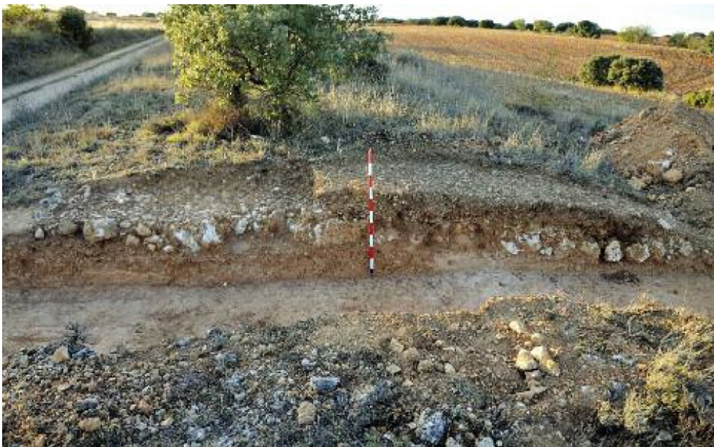
Figure 2: Photography of the Via from Clunia to Segisamo (Castille and León), where the foundation of large limestone rocks and a surface layer of natural ballast over it can be appreciated.

Very briefly, I present the three most important sources for Hispania, described in more detail by Roldán, (1975). Other ancient sources refer to the construction of roads but do not contribute to locate them, like the Book VII of Vitruvius, references in Pliny's Natural History or poet Statius' Silvae . Moreover, other sources like the Tabula Peutingeriana , the Itinerarium maritimum or epigraphic documents like the Tegula of Valencia or the clay tablets of Astorga,