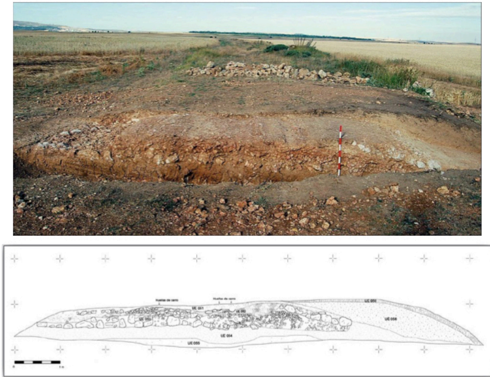
Figure 4: Photography and drawing of the archaeological work at the Via from Italia to Hispania through stepped sections.

This archaeological site has been integrated in a musealisation project that includes architectural elements from the second century to medieval times. Particularly relevant is a segment of urban road, remarkable for the preserved evidence of the portico built on either side of it, and for the extraordinary level of preservation of the paving stones. During the second century, this road was the kardo maximus of Sagvntum , that is to say, the main street of Sagunto; its width was between 4.10 m and 5.40 m (Melchor and Benedito, 2005a:15–17). Adding the arcaded sidewalk, it would have reached about 8 m in width (Fig. 6). Maybe this strata , or urban paved street, was connected with the Via Augusta outside of the city; it is even possible that the 'Vía del Pórtico' was the extension of the Via Augusta inside Sagvntum (Melchor and Benedito, 2005a:15), although this assertion cannot be determined with certainty. The earliest archaeological activities were executed in 1992, when the construction of a building was planned on an abandoned plot that had previously been occupied by a football pitch. The emergence of structures during development fostered the beginning of an archaeological excavation that lasted until 1994.