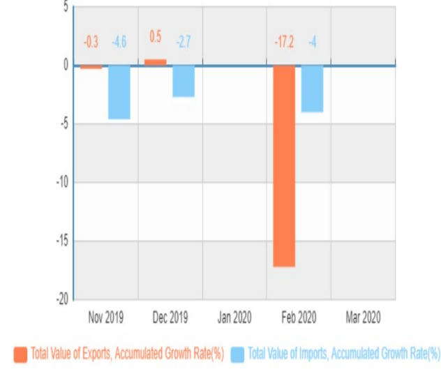
Figure 2. Overview of Chinese Imports and Exports.

According to the National Bureau of Statistics of China [3], Total value of exports in February of 2020 in China in comparison with February 2019 fell down to -17,2 % with 292,448,566 US Dollars (Figure 2).